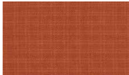
WV-5351-O fat 1/4 yd