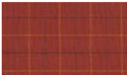
WV-5353-R fat 1/4 yd