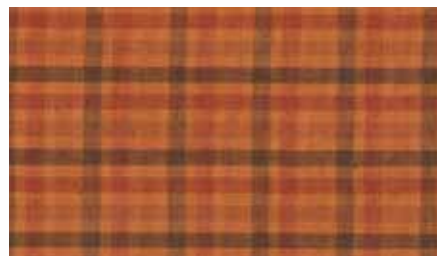
WV-5354-O fat 1/4 yd