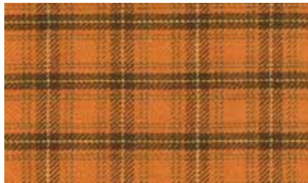
WV-5350-O fat 1/4 yd