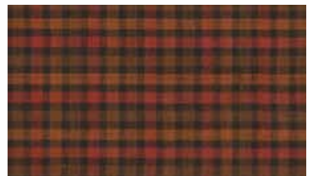
WV-5354-K fat 1/4 yd