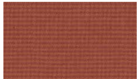
WV-5352-O fat 1/4 yd