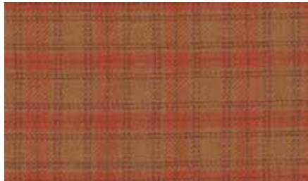
WV-5350-N fat 1/4 yd