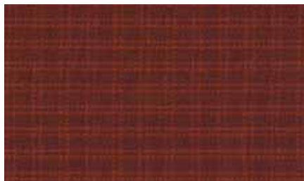
WV-5351-R fat 1/4 yd