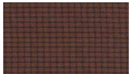
WV-5355-NK fat 1/4 yd