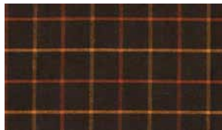
WV-5353-K fat 1/4 yd