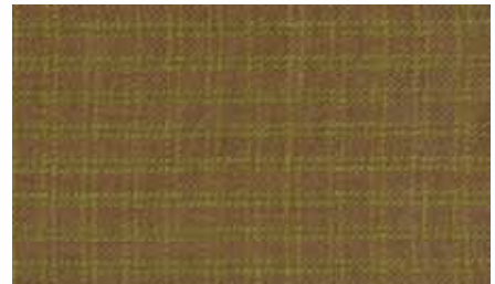
WV-5351-G fat 1/4 yd