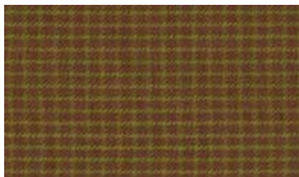
WV-5355-N fat 1/4 yd